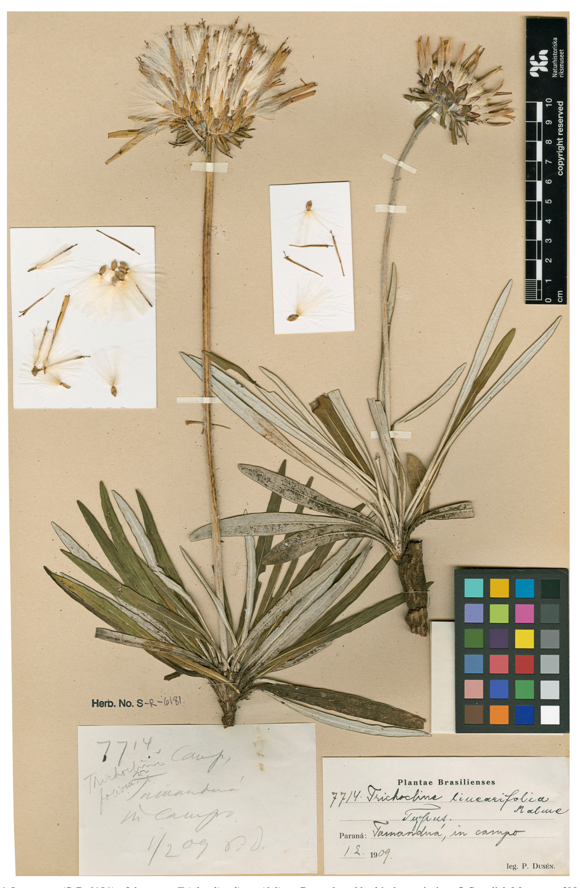
\label{eq:continuous} Fig.~4.~Lectotype~(S-R-6181)~of~the~name~\textit{Trichocline linearifolia}.