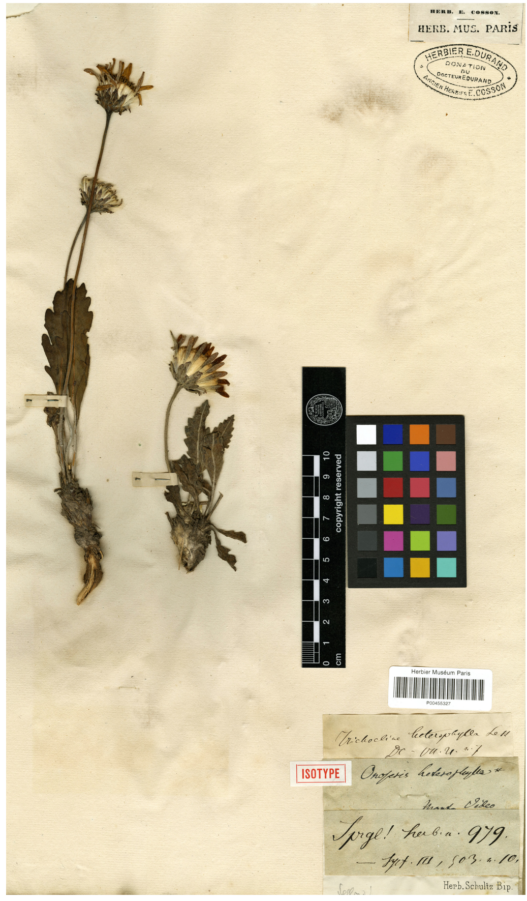
Fig. 2. Lectotype (P 00455327) of the name Onoseris heterophylla ( \equiv Trichocline heterophylla ).