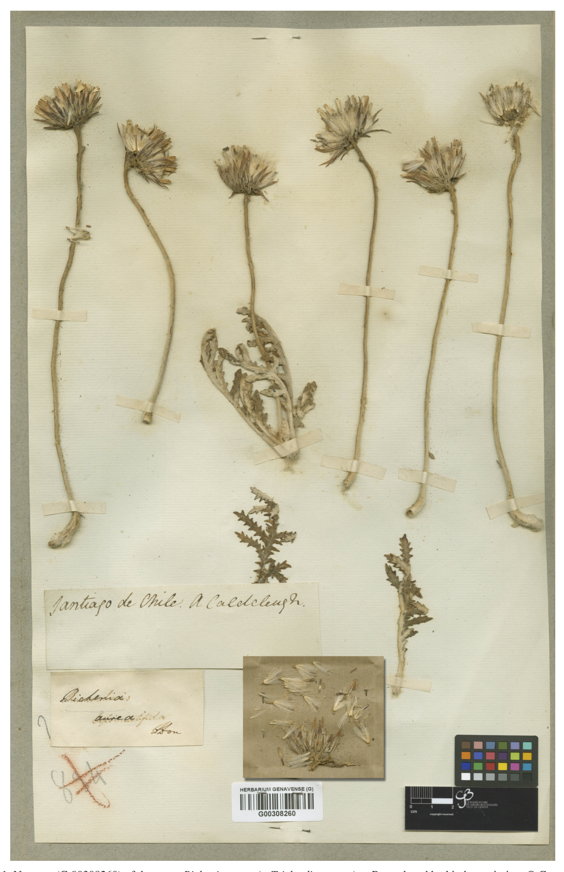
Fig. 1. Neotype (G 00308260) of the name Bichenia\ aurea\ (\equiv Trichocline\ aurea) . – Reproduced by kind permission, © Conservatoire et Jardin botaniques de la Ville de Genève.